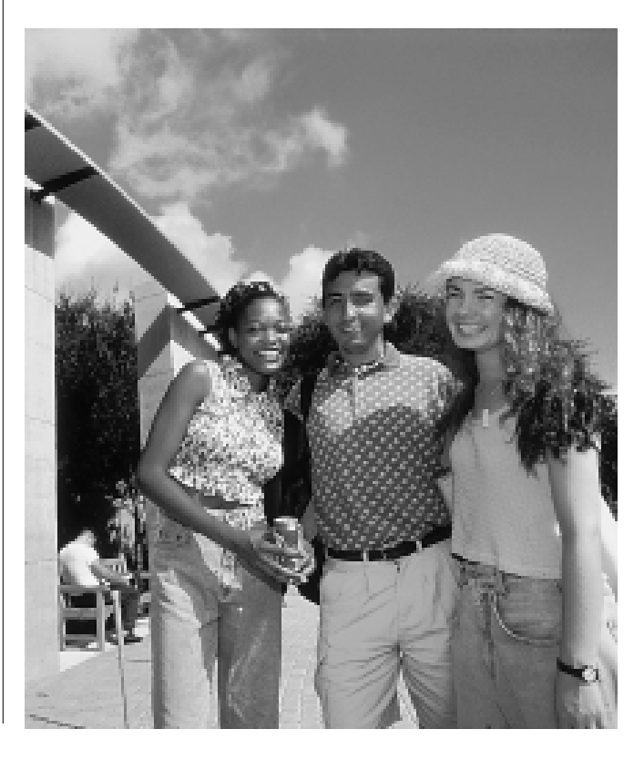
The University of Texas-Pan American

Individuals are protected from coercion, intimidation, interference or discrimination for filing a complaint or assisting in an investigation. ■