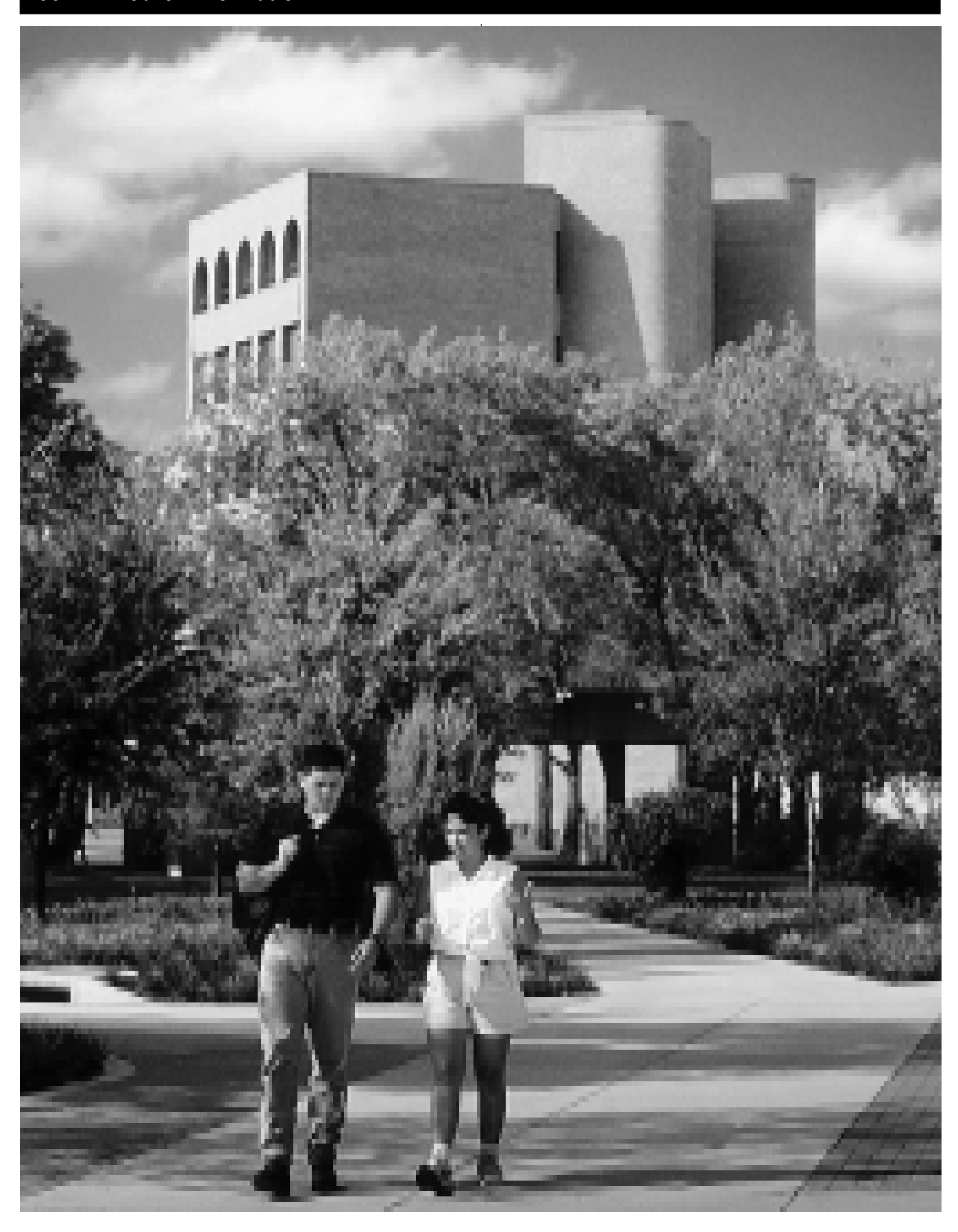
The University of Texas-Pan American